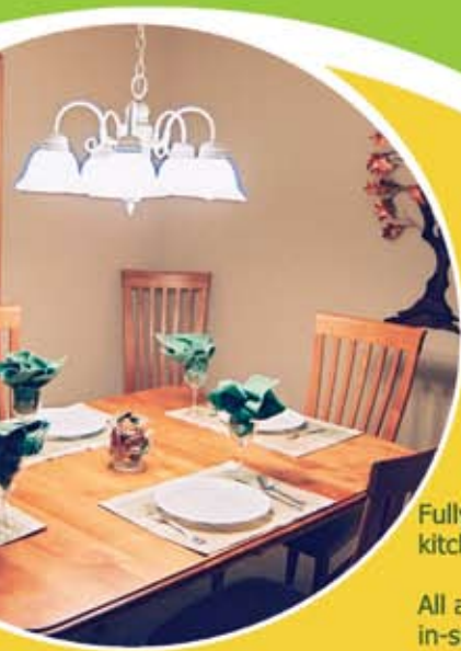
Fully equipped spacious kitchen and dining area